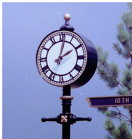
Bezels / Drums / Pillars